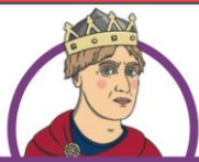
William the Conqueror