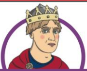
William the Conqueror